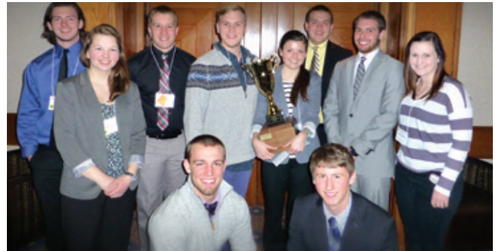
Above: Civil Engineering Students attend the ASCE Midwest Student Conference in Ames