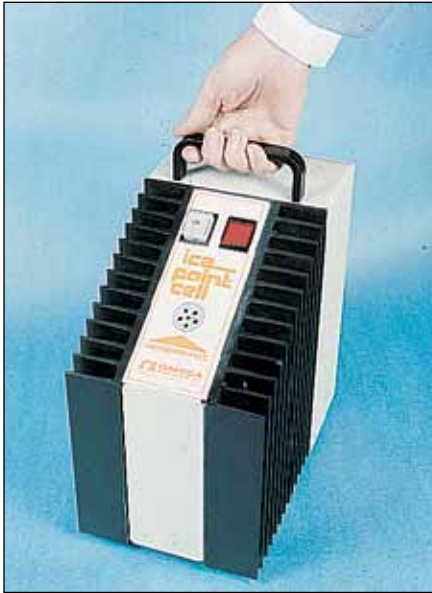
Sturdy handle for easy portability.