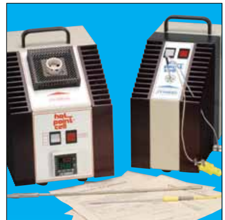
TRCIII ice point™ shown with companion CL950 dry block probe calibrator. See omega.com for details.

The TRCIII ice point™ Calibration Reference Chamber relies on the equilibrium of ice and distilled, deionized water at atmospheric pressure to maintain 6 reference wells at precisely 0°C (32°F). The wells extend into a sealed cylindrical chamber containing the distilled, deionized water. The outer walls of the chambers are cooled by thermo-electric cooling elements. The increase in volume produced by the creation of ice crystals within the